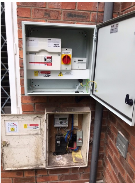
Image 3: The new electrical installation to Support the Solar Installation

The installation begins with the erection of scaffolding followed by the physical fitting of the Photo Voltaic (PV) panels on to the roof. Once this has been done the electrical team will connect the panel cables to the Inverter and the Inverter to the mains feed to the house, which should all be done in 3 days.