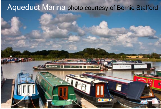
Aqueduct Marina

Aqueduct Marina, the starting point for this walk, was opened in February 2009. The marina has 147 berths, a shop and a café set in beautiful Cheshire countryside. With comprehensive facilities for moorers, visiting boaters and anyone needing to do, or have done, any work on their boat, the marina is an excellent starting point for exploring the Cheshire canal system.